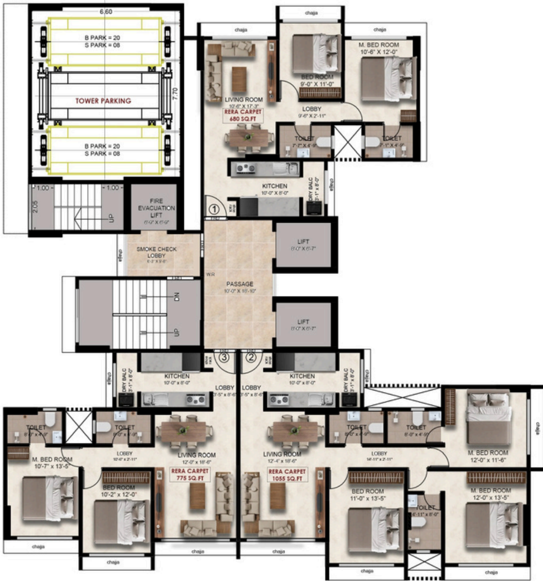
TYPICAL FLOOR PLAN DHANISHTHA CHS